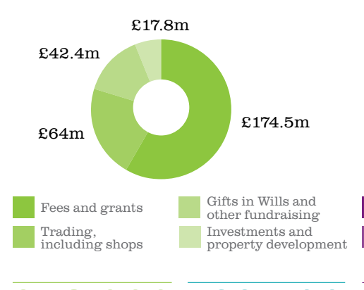
Total expenditure: £294.2m