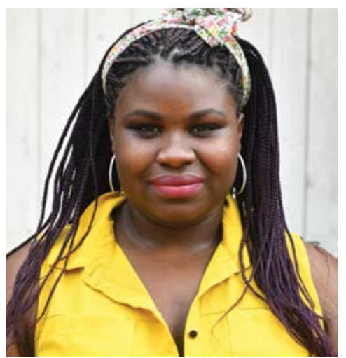
Annual Review 2016