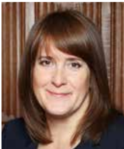
Sarah Jones MP – Founder and Chair

This document summarises a powerful meeting which brought together MPs with young people who had experienced knife crime, either as perpetrators or victims – often both. It has guided the subsequent work of the APPG which will be published in a series of short reports in the coming months. We are incredibly grateful to the young people who took part for their honesty and openness. We cannot hope to solve this crisis until we start thinking of young people not as the problem, but as the solution.