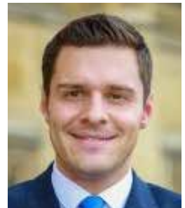
Ross Thomson MP – Vice-Chair

This is not an official publication of the House of Commons or the House of Lords. It has not been approved by either House or its committees. All-Party Parliamentary Groups are informal groups of Members of both Houses with a common interest in particular issues. The views expressed in this report are those of the group.