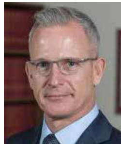
Lord Paddick – Vice-Chair