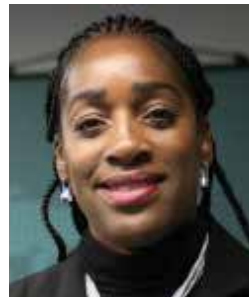
Kate Osamor MP – Vice-Chair