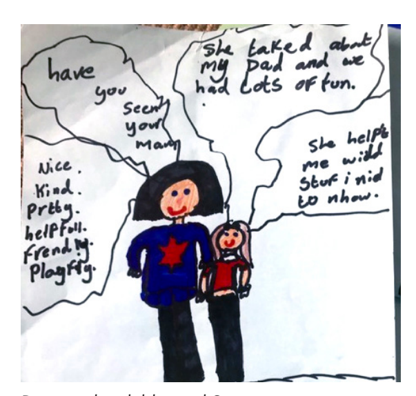
Drawing by child, aged 9

The children involved in the research gave positive responses about the intervention. The majority spoke of all the games and activities they liked to do, and of missing their worker. Seven of the children specifically said that their practitioner had helped them to feel calmer, or they liked them because they helped them to think or to feel differently about things, or they felt happier and they did not have worries anymore.