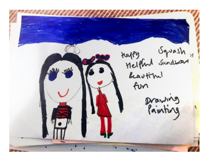
Child, aged 7

that they liked their workers because they had a beautiful smile, and were always happy, not mean and that they were someone they liked very much. The following picture was drawn by a 7 year old child to illustrate how close she felt to her worker, and she said to the researcher the words 'happy, helpful, beautiful, and fun' to relay what was important about her worker. She explained that shew drew a 'big head' for her worker because her worker had 'a big brain and knows lots and can do lots of things'.