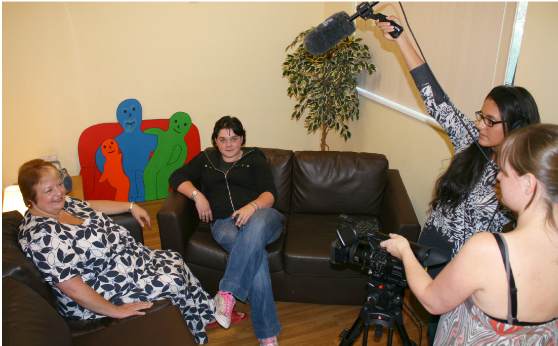
Filming in the family room