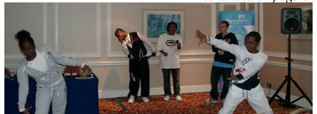
A Solid As A Rock dance routine