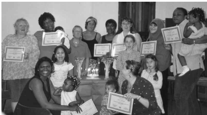
Participants celebrate completing the programme

It all started with a visit to the Parenting Education and Support Forum. I had just been appointed to the post of Family Life and Parenting Support Project Worker at CANDL (Church And Neighbourhood Development in London), a Barnardo's project working with churches mainly in east and south London, and was looking for